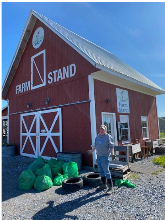
Photo Gallery: South Village Green Up Day, 2023 Seventeen volunteers gathered 38 bags of trash!